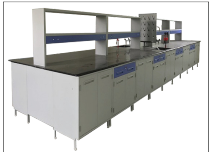
Island Bench in Pedestal Design