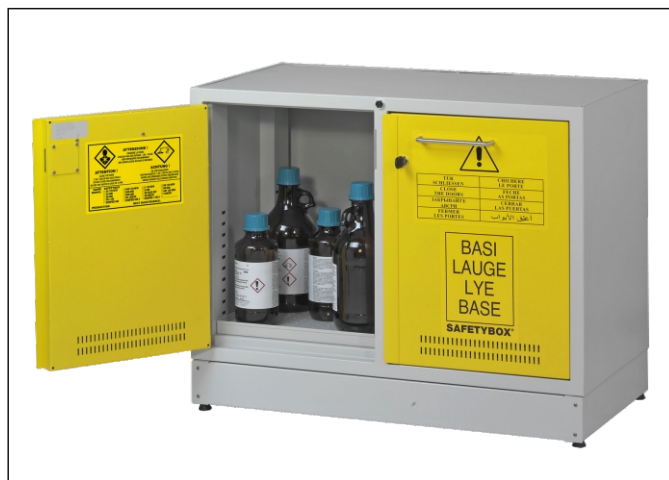
Fume Hood Under Cabinet