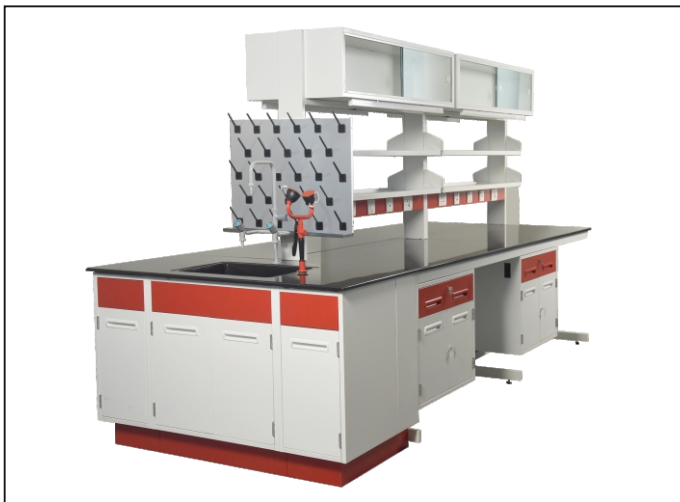
Island Bench in C-Frame Design