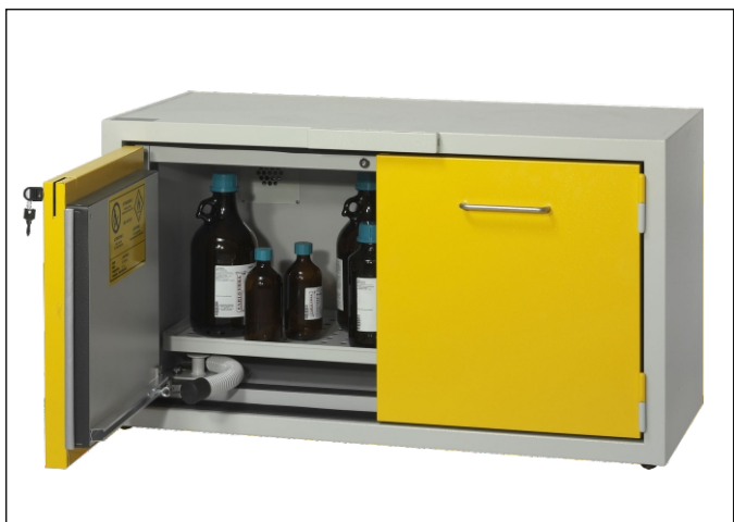
Fume Hood Under Cabinet