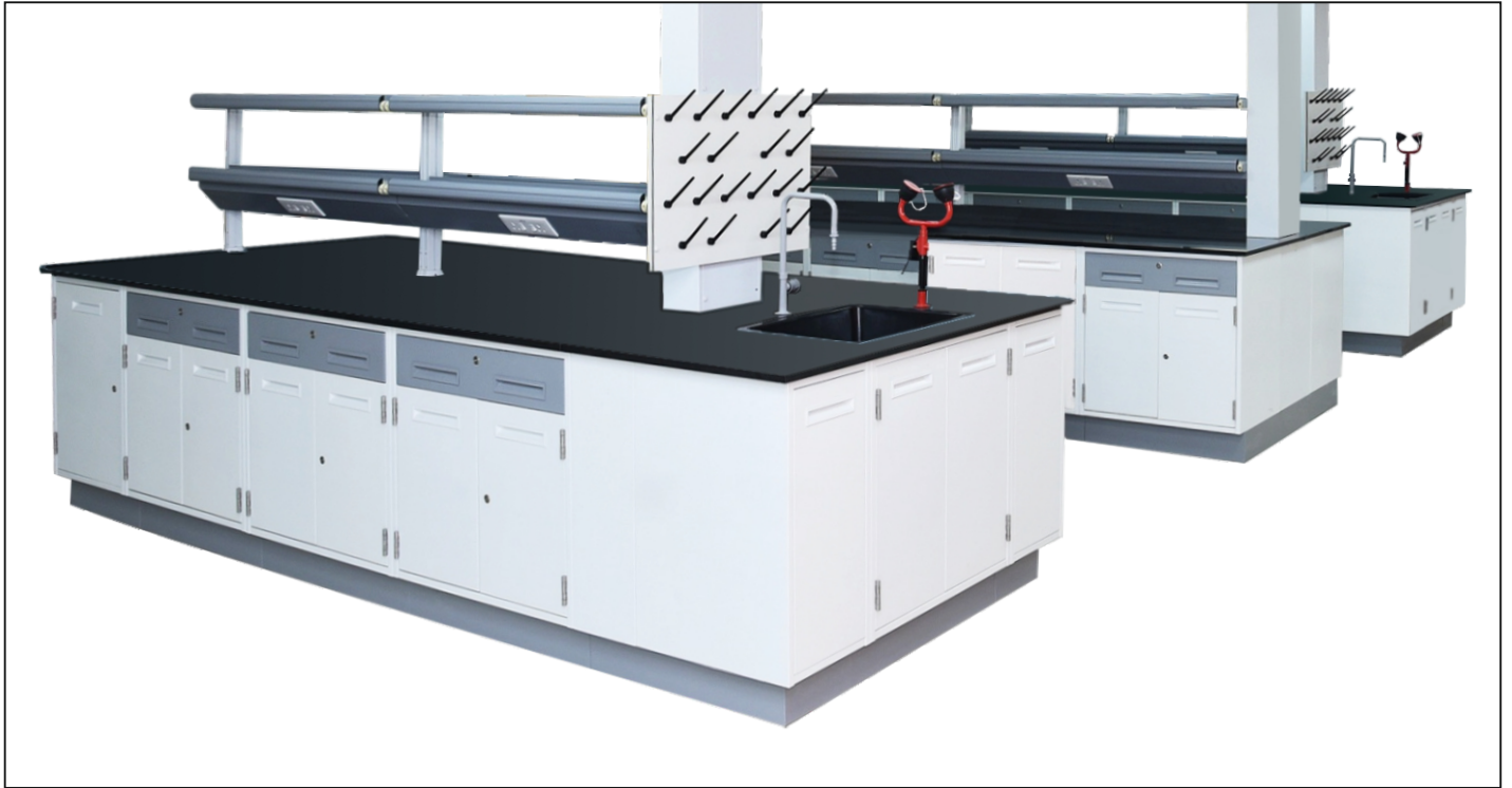
Island Bench in Plinth Mounted Design

Work stations in steel construction can be provided in various designs such as plinth mounted, C-frame mounted or pedestal mounted. Designs are also available for fix or sliding cabinets. Cabinets can be offered in various dimensions and designs with shutters, drawers or combination of shutter and drawer. Generally fabricated out of special quality galvanized iron sheet of heavy gauge. Reagent racks, where ever required also can be offered in different designs.