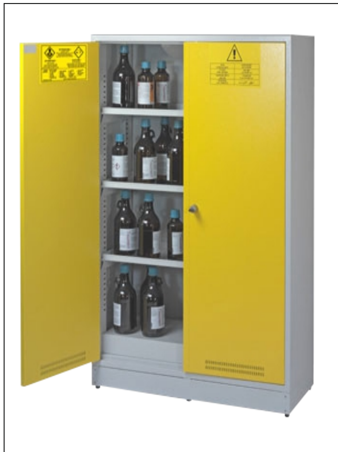
Stand Alone Type

Acids and Bases Storage Cabinet are available in different sizes. This product is imported from expert foreign manufacturers.