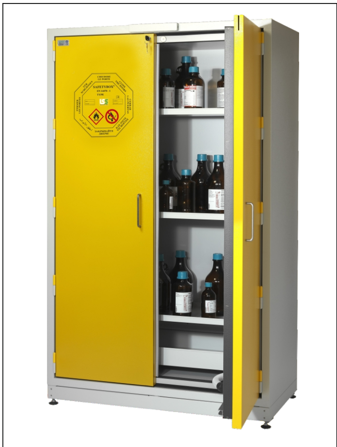
Stand Alone Type

Flammable storage cabinets are available in different sizes and fire ratings. This product is imported from expert foreign manufacturers.